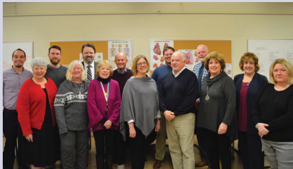
Members of the Valley Regional Complete Count Committee have convened regularly to ensure all area residents are included in the census.