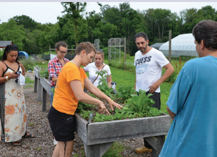
At workshops like this one at Massaro Community Farm, participants learn pickling and other tips to make the harvest last.