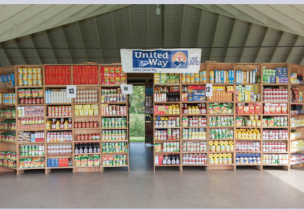
Harvest House at the Shelton River Walk is stocked with thousands of nonperishable food items to be distributed to Valley food banks.