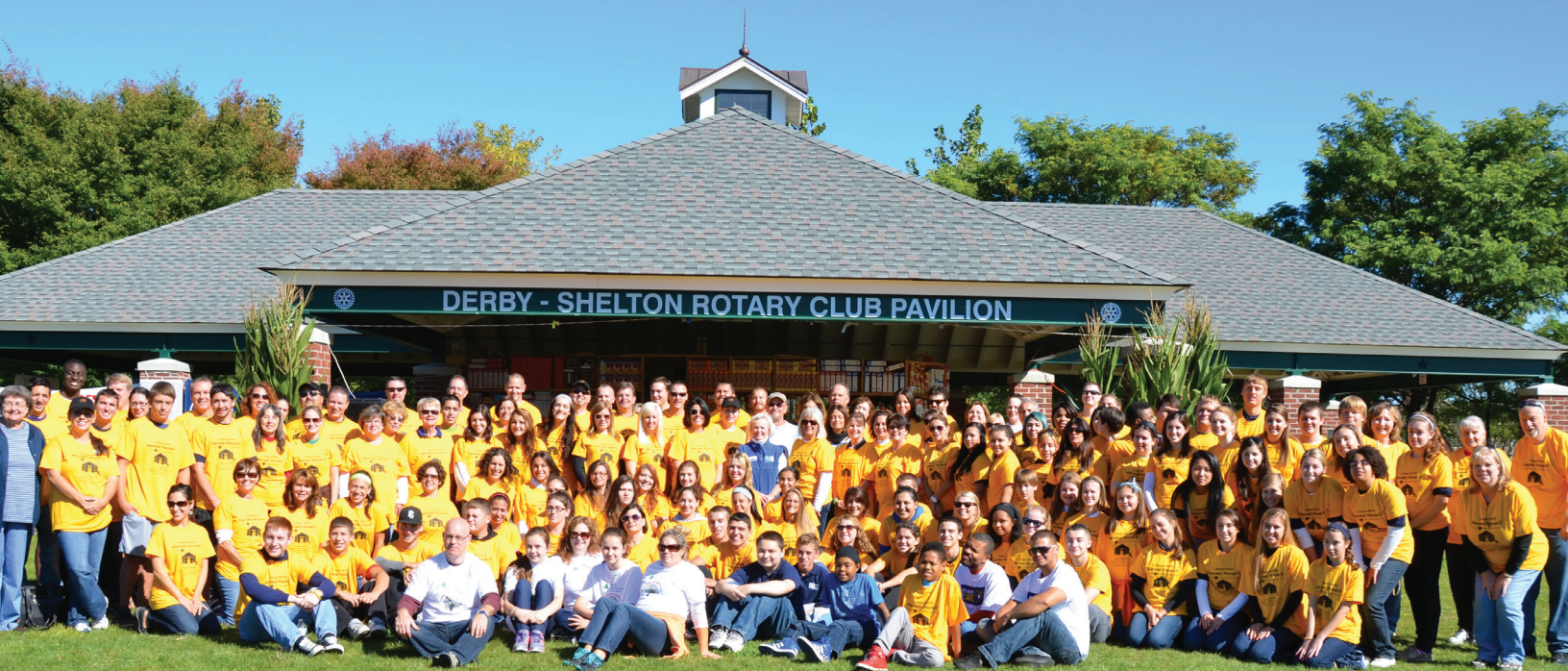
Harvest House V Volunteers