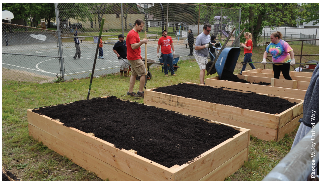
The “Grow Your Own” program started as backyard container gardening and has grown to include community gardens in Ansonia’s Gatison Park (pictured), Pine Lot Park and at Derby’s Irving School.

Many children and families of low-income households risk developing chronic health such as diabetes, hypertension, and obesity as a result of inexpensive high-sodium, carbohydrate-rich diets.