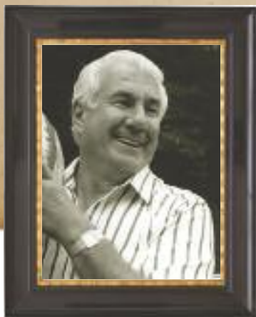
PETER VARTELAS SCHOLARSHIP FUND