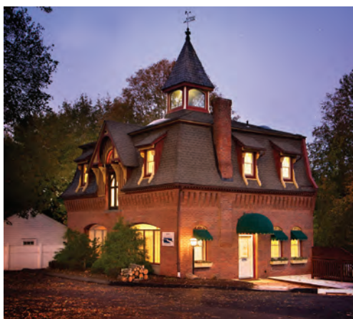
The Valley Community Foundation Headquarters, Derby CT

Six organizations received multi-year responsive grants totaling $401,000. There were also 13 Valley nonprofits that received single-year community grants totaling $30,000.