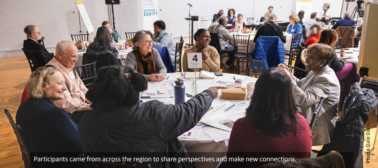
Participants came from across the region to share perspectives and make new connections.