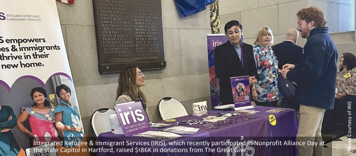
Integrated Refugee & Immigrant Services (IRIS), which recently participated in Nonprofit Alliance Day at the state Capitol in Hartford, raised $186K in donations from The Great Give.