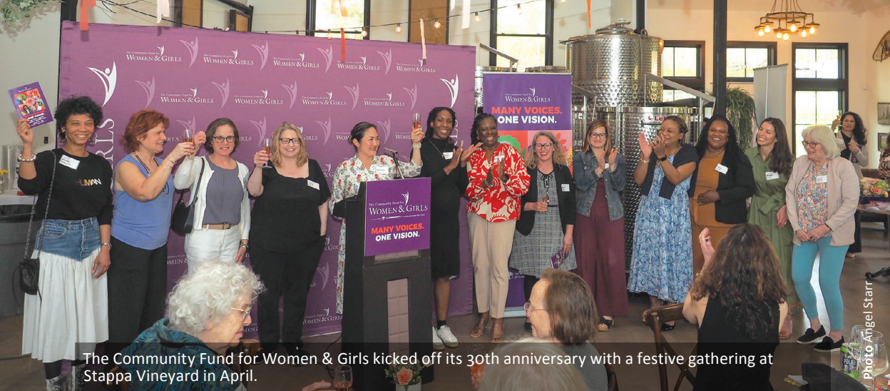
The Community Fund for Women & Girls kicked off its 30th anniversary with a festive gathering at Stappa Vineyard in April.