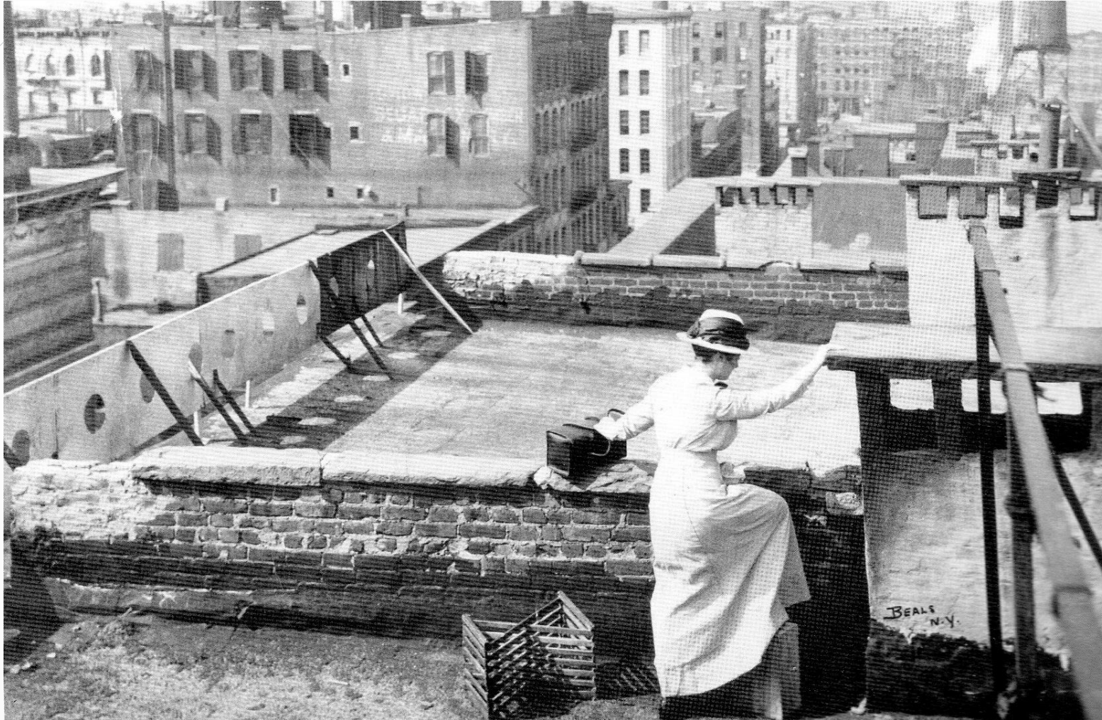
Visiting Nurses in NYC in the 1890's