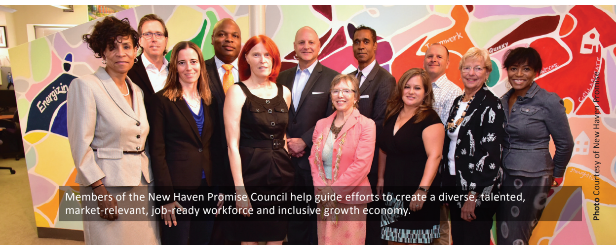
Members of the New Haven Promise Council help guide efforts to create a diverse, talented, market-relevant, job-ready workforce and inclusive growth economy.

The Community Foundation for Greater New Haven (TCF) has awarded a $1.3 million, five-year grant to New Haven Promise (NHP), the nationally-recognized scholarship program that rests on three pillars: college access, college success and career and civic launch in New Haven. TCF co-founded NHP and has supported it since 2011. This continued funding has been awarded due to NHP's alignment with TCF's priority of creating opportunity for local residents through inclusive growth. Much more impactful than scholarships alone, NHP is helping to build a talented, diverse workforce through its efforts of creating a college-going culture, fostering student career development and cultivating partnerships with local universities and private sector businesses and institutions. The grant will enable NHP to increase its organizational capacity and sustainability.